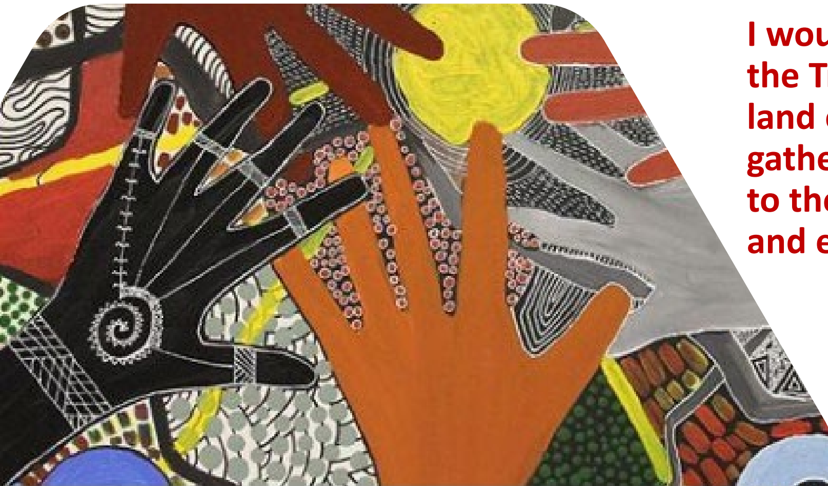
Over Time We

I would like to acknowledge the Traditional Owners of the land on which we are gathered and pay my respects to their Elders past, present and emerging.